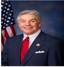
Congressman Roger Williams