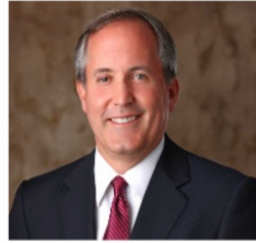
Attorney General Ken Paxton