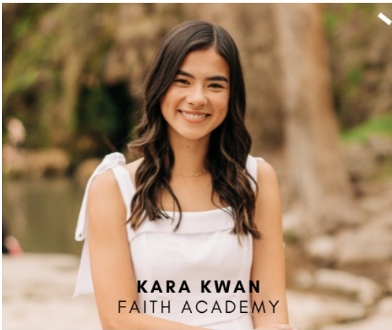
KARA KWAN FAITH ACADEMY