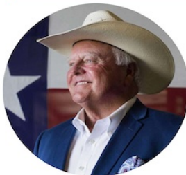
with special guest SID MILLER Texas Agriculture Commissioner